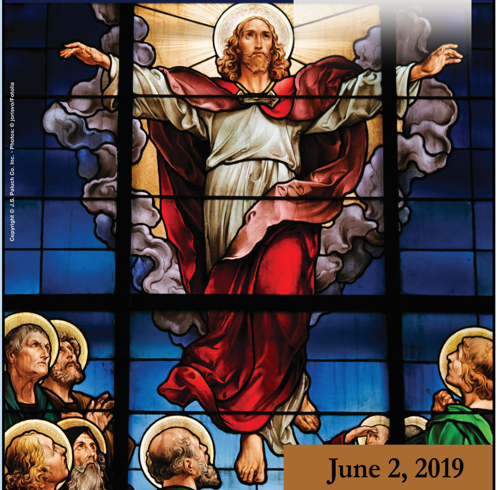
Copyright © J.S. Paluch Co. Inc. - Photos © Jorisevofotolia