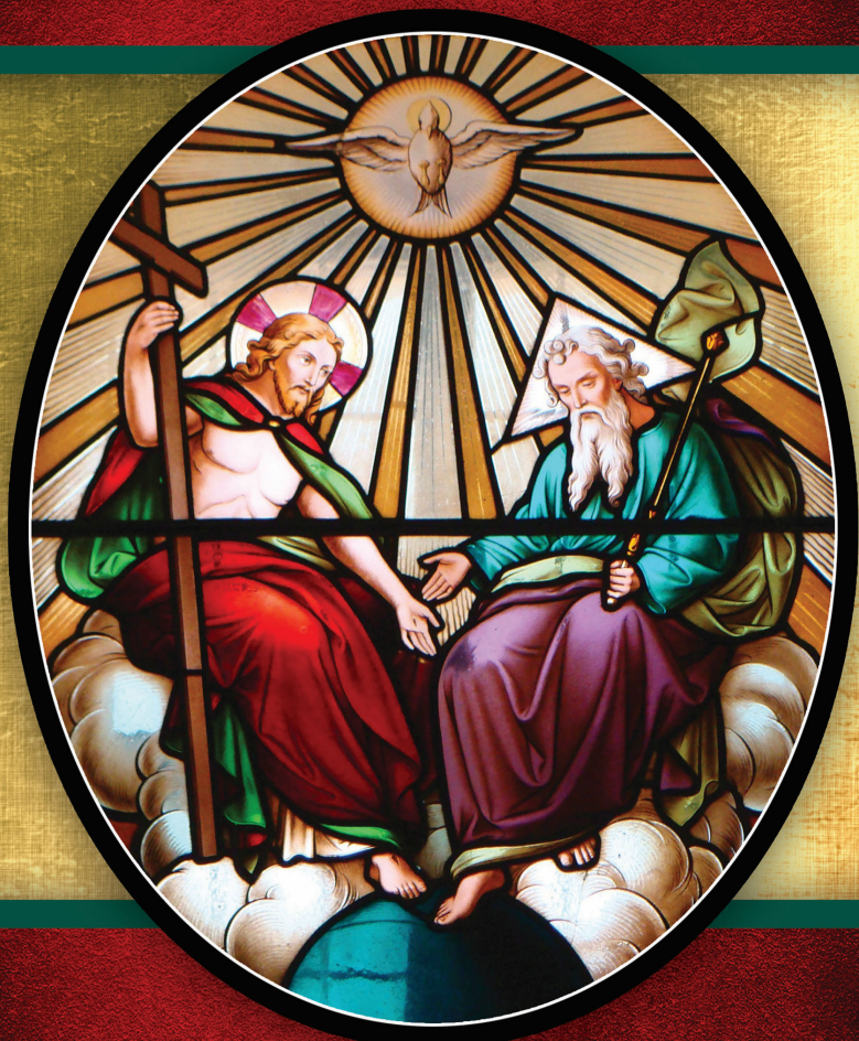
Copyright © J.S. Paluch Co. Inc. - Photos: © Peter Schmedle (Own work) [CC BY-SA 3.0 via Wikimedia Commons]

O Lord our God, how wonderful your name in all the earth!