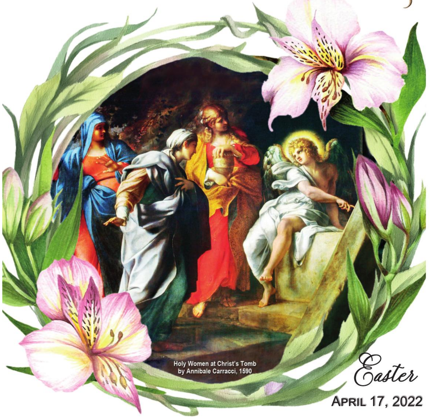
Holy Women at Christ's Tomb by Annibale Carracci, 1590