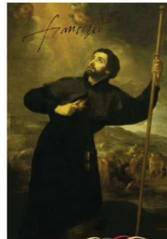
Praying with Saint Francis Xavier The Novena of Grace

God our Father, as St Francis Xavier travelled to the ends of the earth, impelled by love of Christ and afire with his good news, give me the trust and the grace to base all that I do entirely on you, safe in the knowledge that you raise up the lowly and fill them with good things. Through Christ our Lord. Amen.